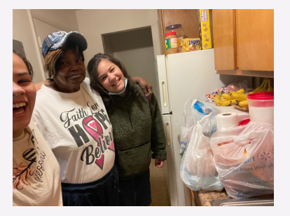
Our Project Leads with some of our families

A few words from one of our SC Project Leads: